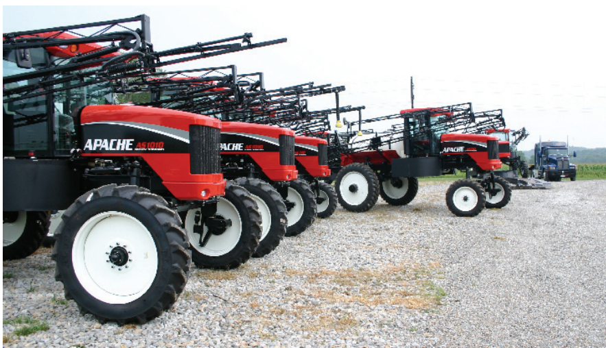
A pair of the recently introduced 2006 Apache AS710 sprayers are loaded onto a lowboy bound for Kansas outside of Equipment Technologies' Mooresville, IN, factory. Equipment Technologies, which builds its sprayers to order, has enjoyed a busy year, thanks in part to the role of sprayers in combatting Asian soybean rust. The firm's other new model, the Apache AS1010, is seen in the foreground.